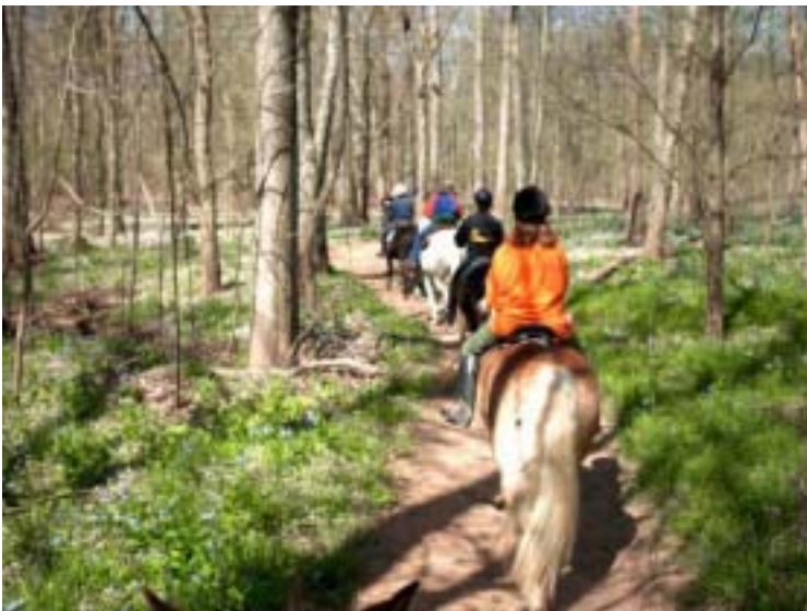
Here are a couple more pictures from The Blue Bell Ride.