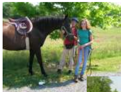
Left: Family fun at Woodstock Park

For More Information and Tickets Visit www.MNIE.net or Call 410-823-5579