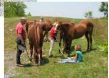
Right . Relaxing after the Woodstock Ride