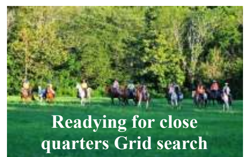
Readying for close quarters Grid search