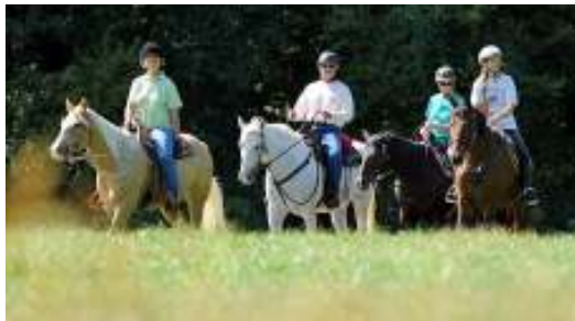
More photos throughout newsletter.