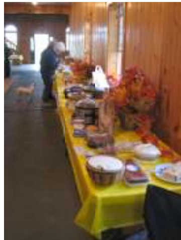
TROT Membership Meeting, Saturday, October 10 th