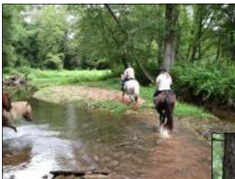
Dry Seneca Ride photo's continued from page 2.