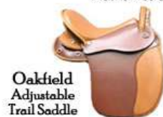
Oakfield Adjustable Trail Saddle