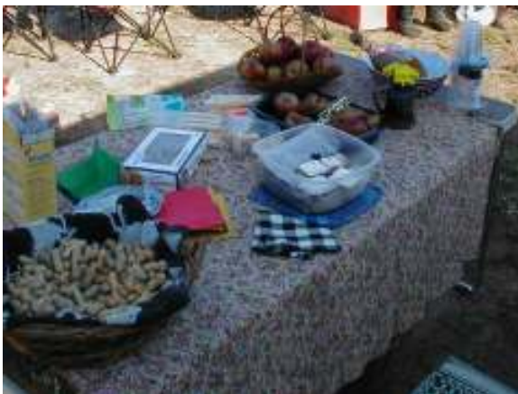
Treat table for riders and horses.