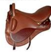
SPIRIT Lightweight Endurance Saddle