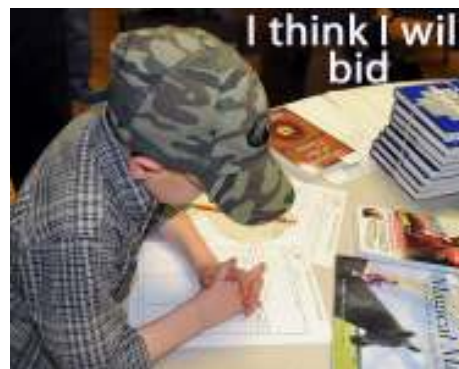
I think I will bid