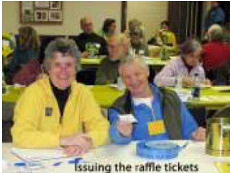
Issuing the raffle tickets