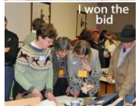
I won the bid