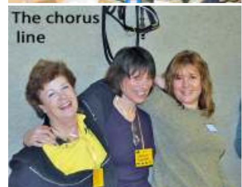
The chorus line

Annual Meeting