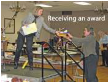
Receiving an award