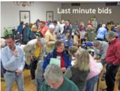
Last minute bids