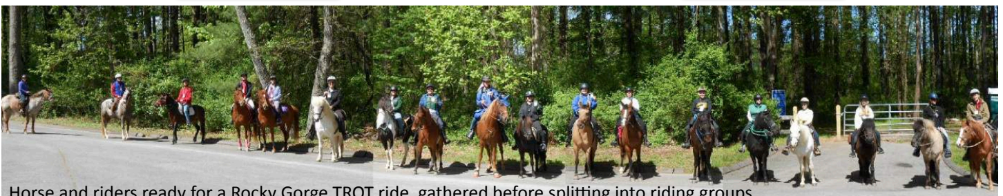
Horse and riders ready for a Rocky Gorge TROT ride, gathered before splitting into riding groups