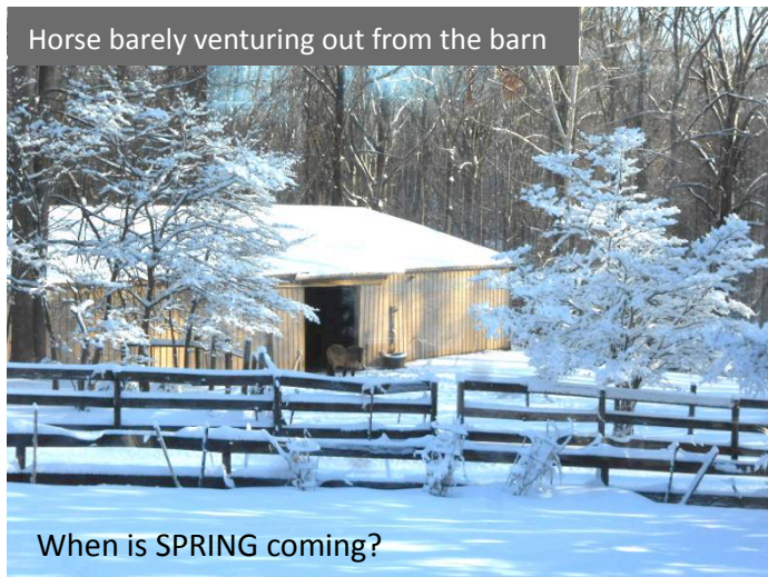
When is SPRING coming?