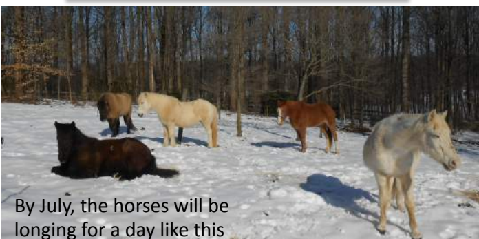
By July, the horses will be longing for a day like this

The next meeting of the Baltimore area group will be held in early May at Loblolly Farm in Hampstead. A demonstration of working equitation is planned.