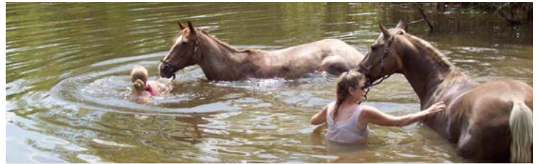
for a similar water frolic after an earlier ride