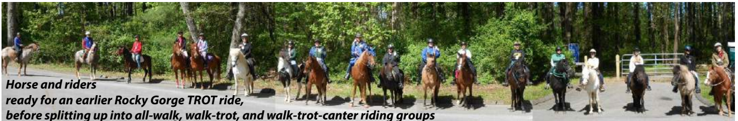
Horse and riders ready for an earlier Rocky Gorge TROT ride, before splitting up into all-walk, walk-trot, and walk-trot-canter riding groups

For updated ride listings, please watch the TROT and Maryland Trail Riders Yahoo list-serves. Please note that everyone is welcome to announce our TROT rides and invite folks to join, but to protect the integrity of our ride program, in that announcement please include all the above requirements and accurately copy the ride information.