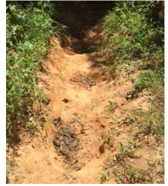
Eroded section to be rerouted this fall.

Rachel Carson Park is a jewel in the crown of the Montgomery County park system. It is an environmental park dedicated to keeping the natural and unique ecosystem in a pristine condition. Some time if you are riding the beautifully maintained horse trails in the park, take a leisurely look around you – and recognize some of the hidden treasures of the park. And be ready to join us this fall to do some trail work while basking in the beautiful surroundings. You might be lucky enough to spot that rare and shy Baltimore oriole!