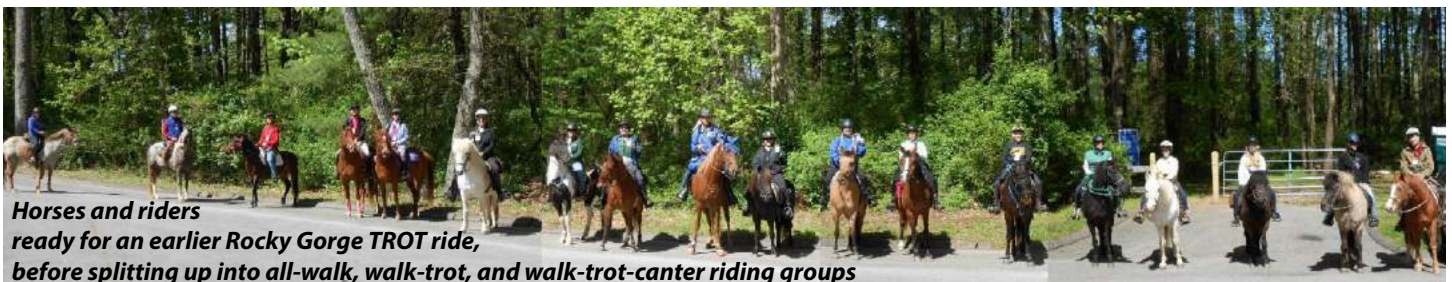
Horses and riders ready for an earlier Rocky Gorge TROT ride, before splitting up into all-walk, walk-trot, and walk-trot-canter riding groups