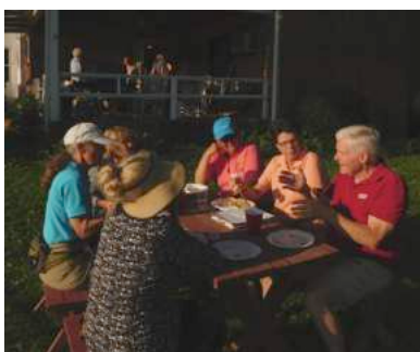
Some of the group enjoying the dinner before the clinic