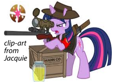
clip-art from Jacquie

Why should private lands concern us? About 90% of respondents to a MHC survey taken last year said they are recreational riders; 76% utilize trails on private lands. They are concerned about crossing hunted private lands to get to public lands not hunted and that our public parks are bordered by private lands that may be hunted. This prompts questions like: