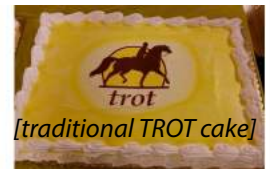
[traditional TROT cake]

THERE IS ALSO OUR TRADITIONAL SILENT AUCTION. Come get bargains!