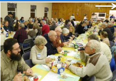
Some of those enjoying the camaraderie at last year's annual dinner

[Photos and articles without attribution are from the Newsletter Editor]