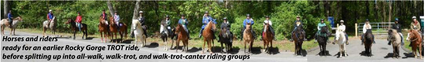
Horses and riders ready for an earlier Rocky Gorge TROT ride, before splitting up into all-walk, walk-trot, and walk-trot-canter riding groups

Trail Riders list-serves or contact the ride leader, who sometimes can arrange for another participant to pick up a horse that loads and travels well. Finally, everyone is encouraged to announce our TROT rides widely, but to protect our ride program's integrity, please include all the above requirements and do not publicly announce any start time, so everyone coming must check with the ride leader.