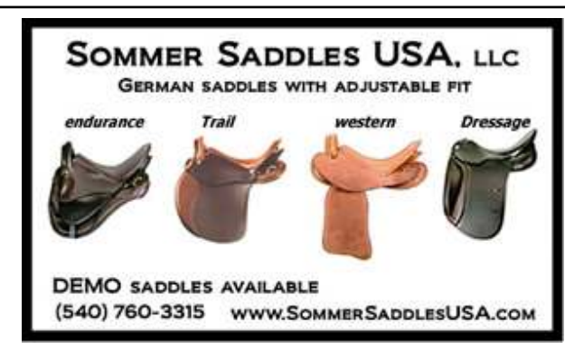
Quick link to Sommer Saddles USA, LLC www.SommerSaddlesUSA.com

"Trail Riding Heaven" A top quality boarding & training facility also offering several well trained school horses for lease. Instruction and training for horses and riders, from beginner to advanced. Several instructors to choose from. Your instructor is also welcome. The stable is located on 400 beautiful acres adjoining the C&O Canal with 100s of miles of National Park trails. Personal quality individual care, large indoor arena, 3 outdoor arenas, large stalls, many other features for your horse's comfort: mats, fans, fly spray system, hot showers, unlimited free choice premium hav made on the farm. Your horse is given whatever he needs, no limits. We have several vacancies and very reasonable rates. Full quality care and self care.