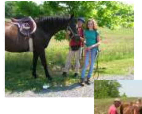
Left: Family fun at Woodstock Park

Buffet Dinner · Beer · Wine · Soft Drinks Live Band "Release" · Silent & Live Auction 50/50 Raffle Drawing Auction Items Now Being Accepted For More Information and TicketsVisit www.MNIE.net or Call 410-823-5579