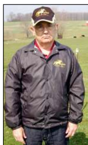
Front Snap jacket

Please note: the TROT ware is unisex - we are seeking female models Thank you to our brave male models