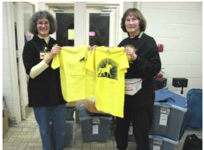
Buy your TROT T-shirt now