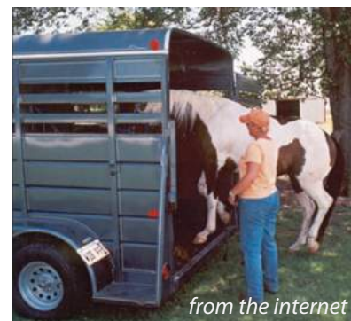
from the internet

Finally, everyone is encouraged to announce our TROT rides widely and invite folks to join. However, when doing so, to protect our ride program, please include all the above requirements and do not publicly announce any start time, so everyone coming must check with the ride leader.