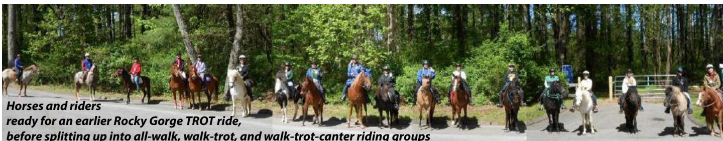
Horses and riders ready for an earlier Rocky Gorge TROT ride, before splitting up into all-walk, walk-trot, and walk-trot-canter riding groups