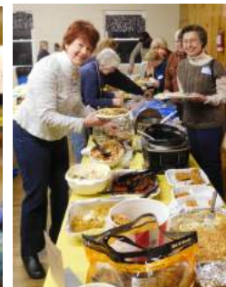
Enjoying the buffet