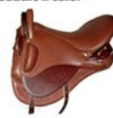
SPIRIT Lightweight Endurance Saddle