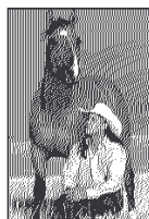
GaWaNi Pony Boy