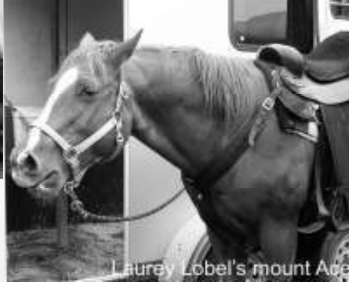
Laurey Lobel's mount Ace