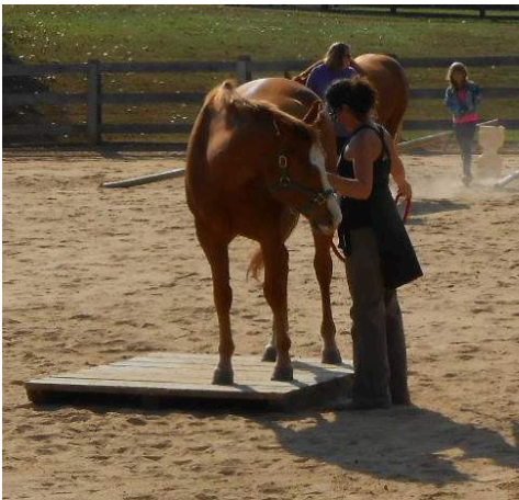
more from the Purdum clinic

I was extremely impressed at how much all the riders and horses improved during the morning's work. Obstacles that initially were scary monsters became smooth and easy to negotiate, through Scott's and Grace's coaching and the riders' efforts.