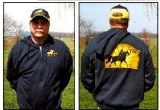
zippered hooded sweatshirt and TROT cap

TROT LOGOWEAR: For other great presents for yourself or your friends, how about a GORGEOUS piece of TROT logowear? A sweatshirt ($21), zippered hooded sweatshirt ($30; shown at right), lined nylon jacket ($35), or lined nylon windshirt ($35) is perfect for cold winter days; a regular T-shirt ($15), long-sleeved T-shirt ($20), polo-shirt ($20), or cap ($15) is perfect for almost any time; or plan already for the warm weather next summer with a tank top ($15). Most items are black fabric with yellow TROT insignias (some the small insignia, some the large insignia, some both); T-shirts and polo shirts are also in yellow with black insignias. Sizes are unisex S, M, L, XL and XXL. For more info about the items and to order, please contact Barbara Sollner-Webb (at <bsw@jhmi.edu> or 301-604-5619), and your present will be shipped ASAP.