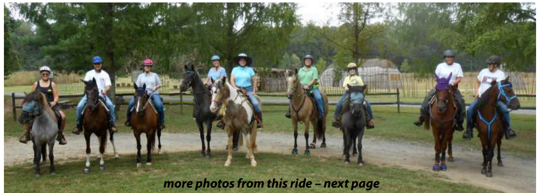
more photos from this ride – next page