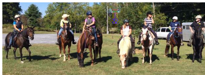
ready to ride at Rachel Carson