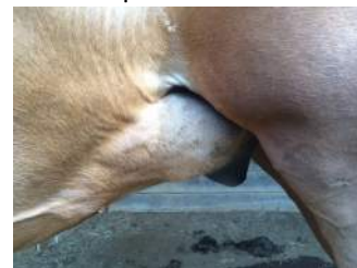
Ace's abscess, pre-draining