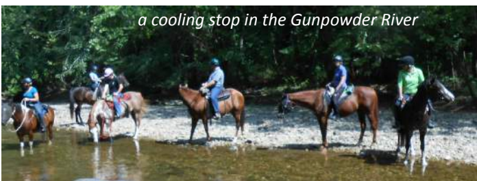
a cooling stop in the Gunpowder River